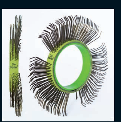
Die Blaster® Belt, Carbon Steel, 11 mm, Left