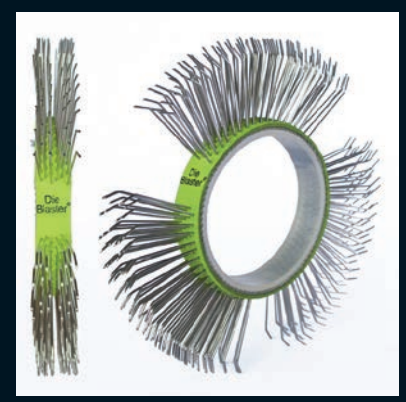
Die Blaster® Belt, Stainless Steel, 11 mm