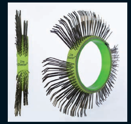
Die Blaster® Belt, Carbon Steel, 11 mm, Right