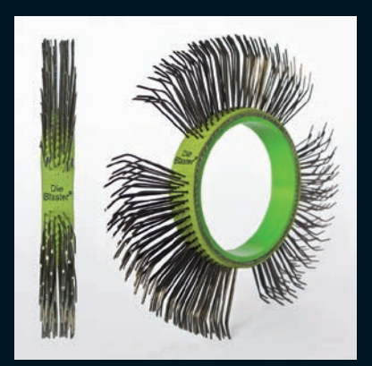
Die Blaster® Belt, Carbon Steel, 11 mm