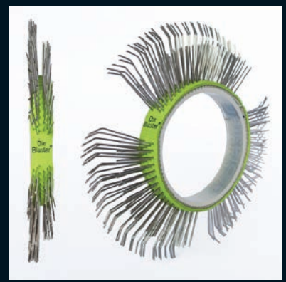
Die Blaster® Belt, Stainless Steel, 11 mm, Right