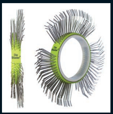
Die Blaster® Belt, Stainless Steel, 11 mm, Left